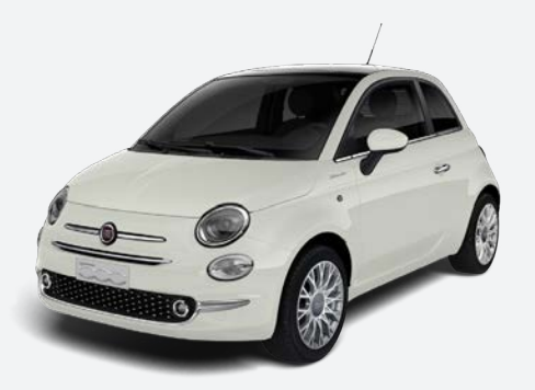
Gelato White (Standard)