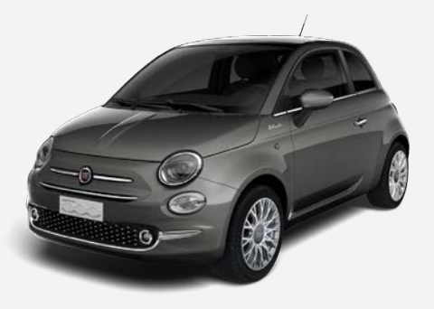
Grey (Dolcevita only)