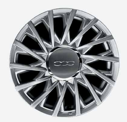
4AV - 15-Inch Alloy Wheels (Lounge)