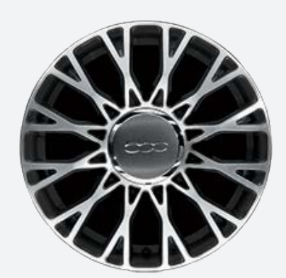
7PN - 16-Inch Alloy Wheels Black painted with Diamond Finish (Dolcevita)