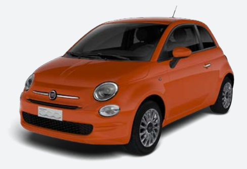
Orange (Lounge only)