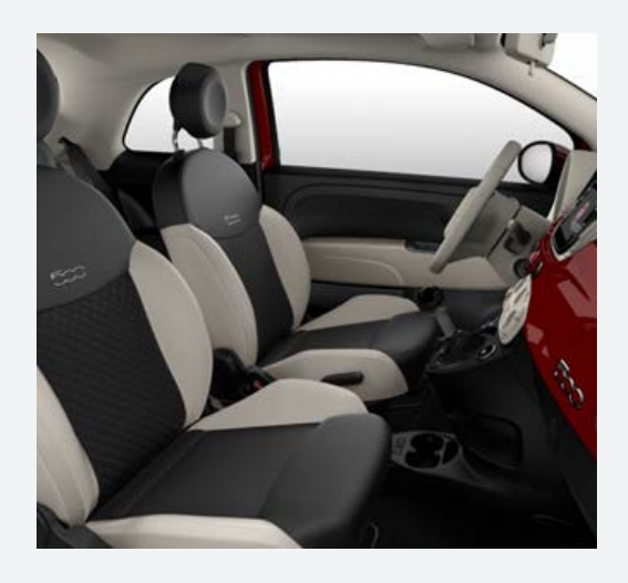
654 Black Fabric Seats with Ivory Inserts Standard - Dolcevita