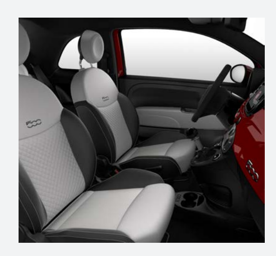
138 White Fabric Seats with Black Inserts and White Standard - Dolcevita